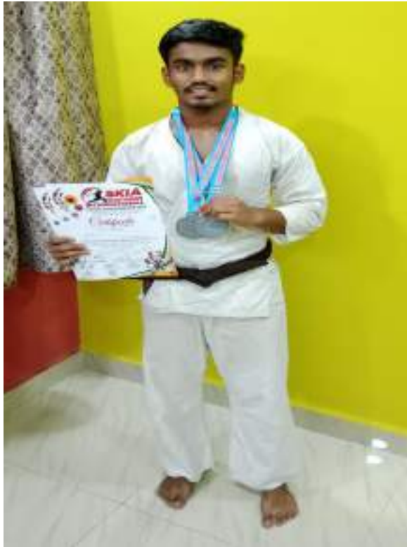
Silver medal in Kata and Kumite International Karate Tournament