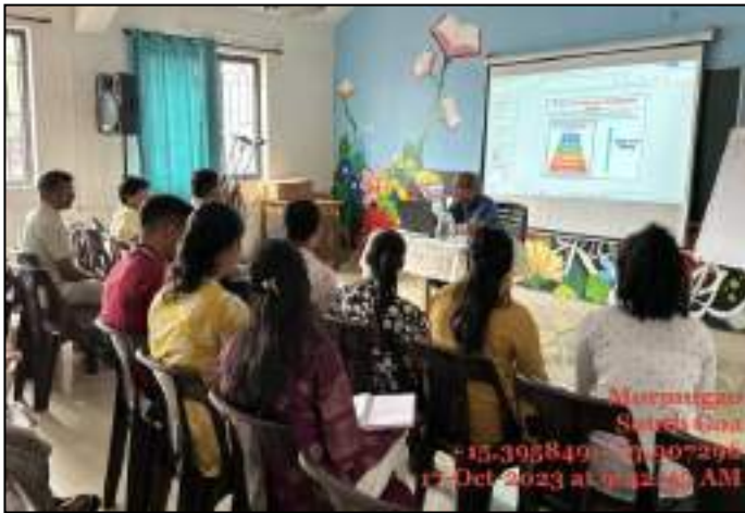
Talk on Outcome Based Education