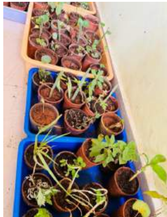
Medicinal Plant Gallery