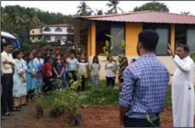
Van mahotsov day