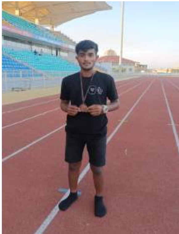
Bronze medal in Pole Vault Inter College Athletics