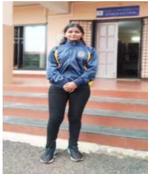
Member of West Zone Inter - University Hockey Team (Women)