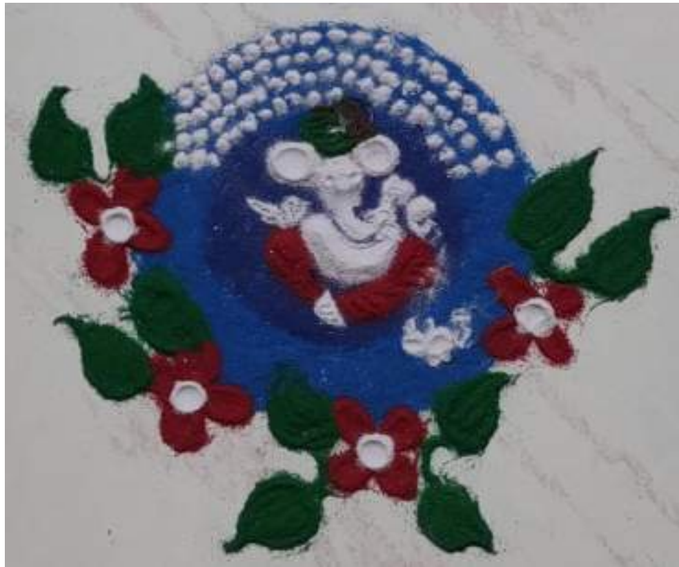
Rangoli competition on the occasion of Ganesh Chaturthi.