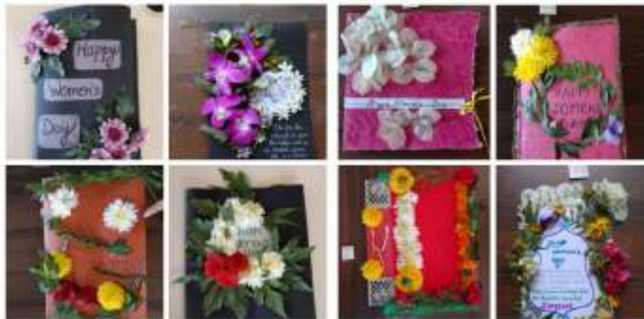
Floral Card making competition