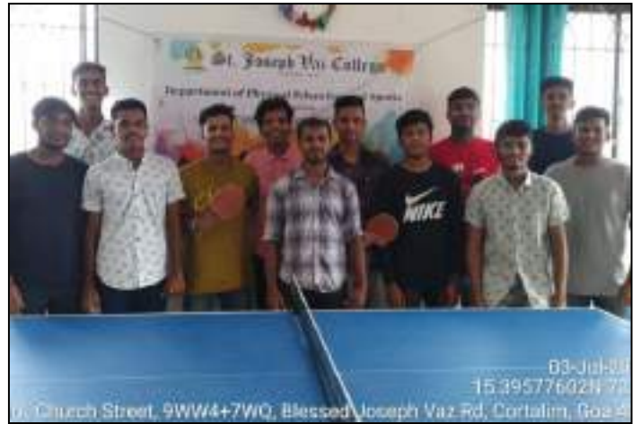
Intramural – Table Tennis