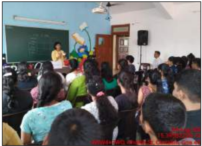
Students Council Election