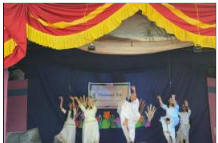
College Annual Day