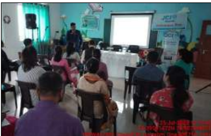
Session on ICT tools for teaching