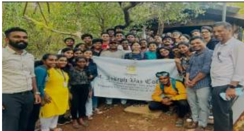
A Trip to Dr. Salim Ali Bird Sanctuary, Chorao on the International Day of Wetlands