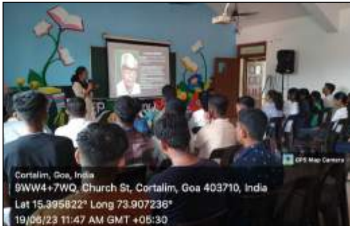
National Reading Day