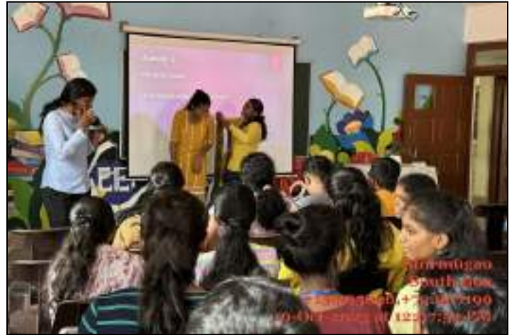
Healthify lecture series