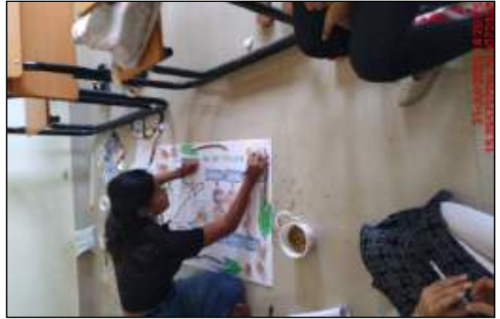
Millet poster making competition