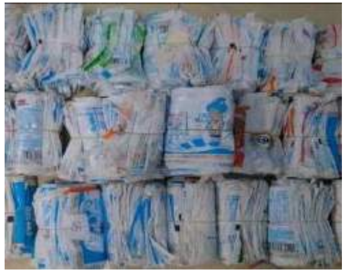
Empty milk packets collection activity