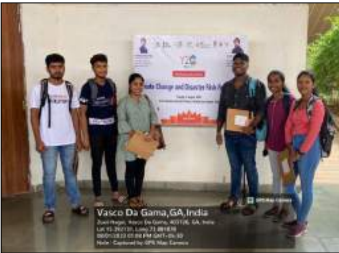
G20 University Connect Engaging Young Minds