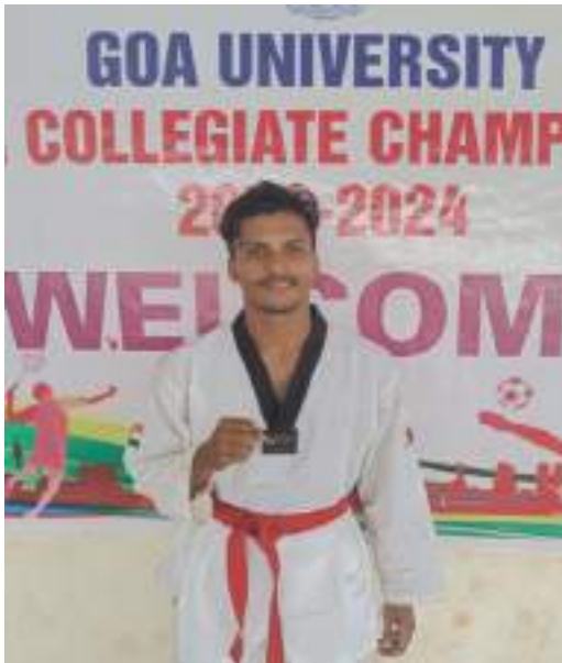
Silver medal in Inter college Taekwondo championship