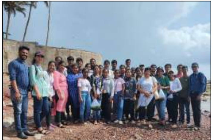
Algae sampling at Anjuna beach