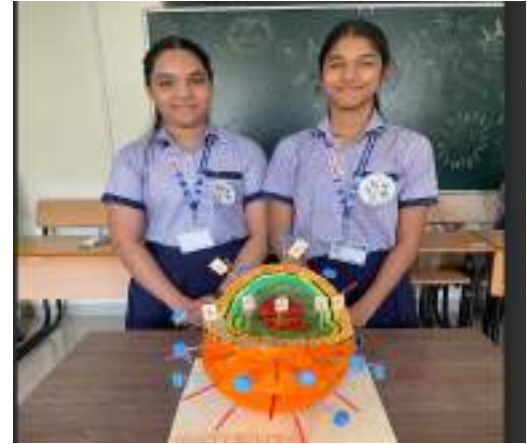
Model making competition ( Model of