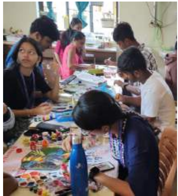
'Leaf Art' competition