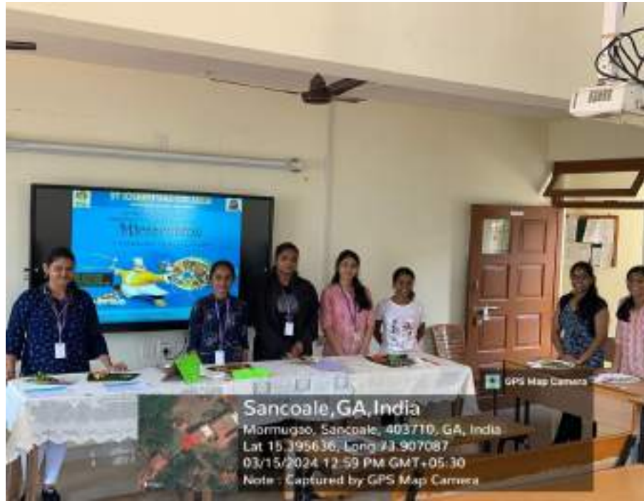
‘Microcuisine’ an Innovative Micro chef cooking competition by MBSI student unit.