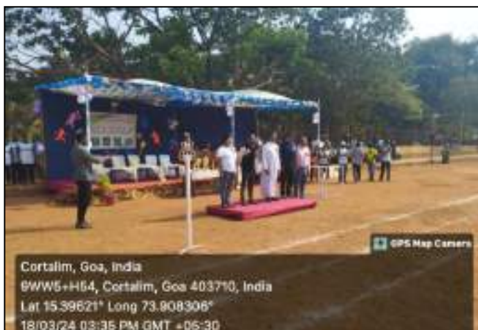
College Sports Day