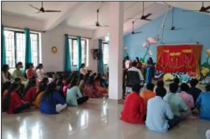
Ganesh Chaturthi Celebration