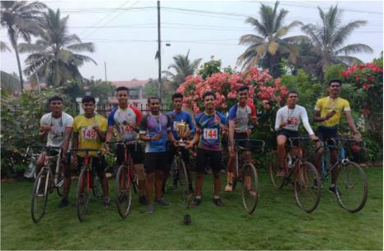
3rd Place for Cycling organized by Goa University and 1 st place in cycling organized by Guirdolim club