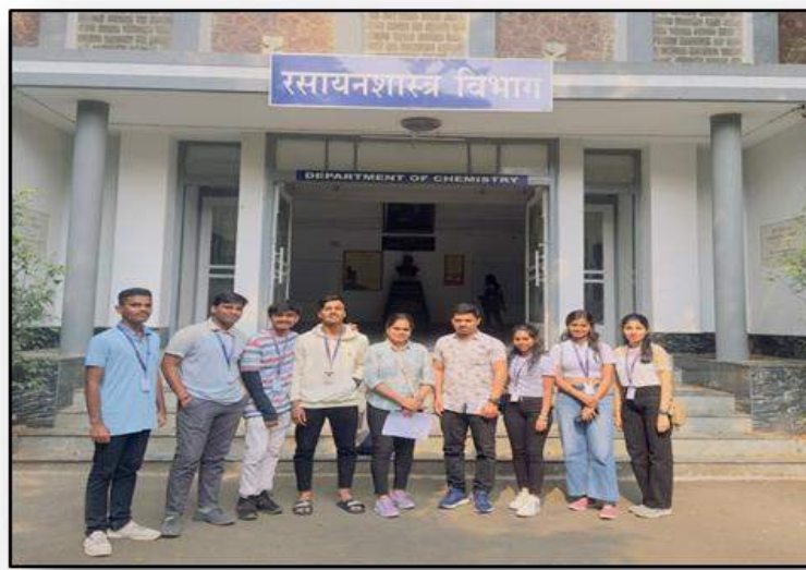
Visit to Savitribai Phule, Pune University