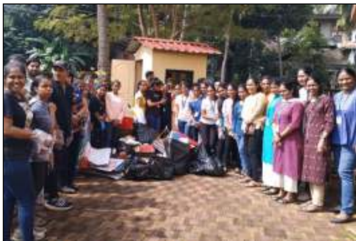
Swachhata Hi Seva