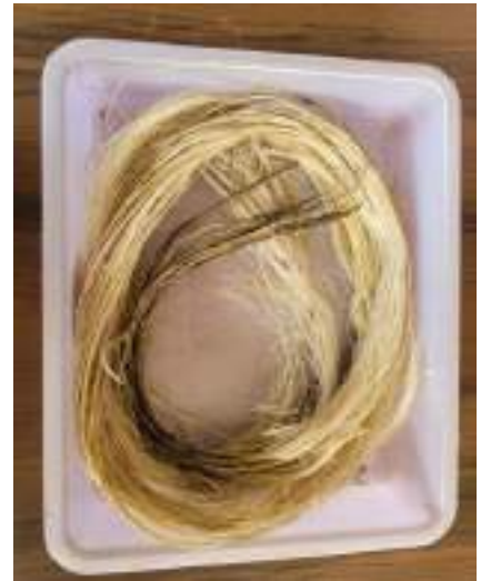
Fiber extraction from Agave leaves