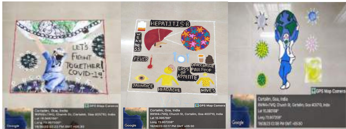
Rangoli competition for UG college students on theme 'Viral Diseases'