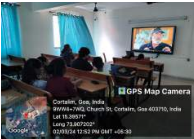
Microbial Moviemania “Fantastic Fungi” organised by MBSI student unit.