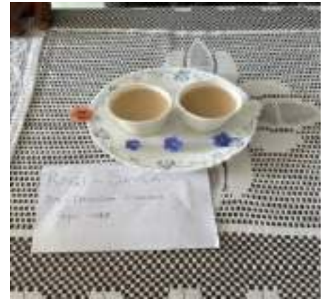
Millet activities, commemorating year 2023 as International year of Millets (Rangoli competition, Cook with millets).