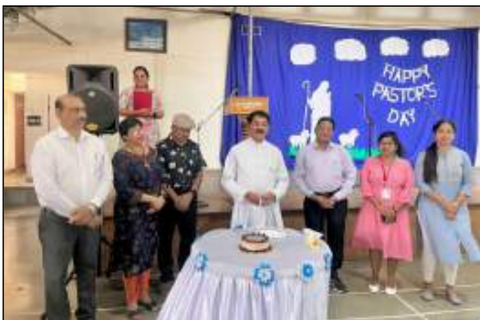
Pastors Day Celebration