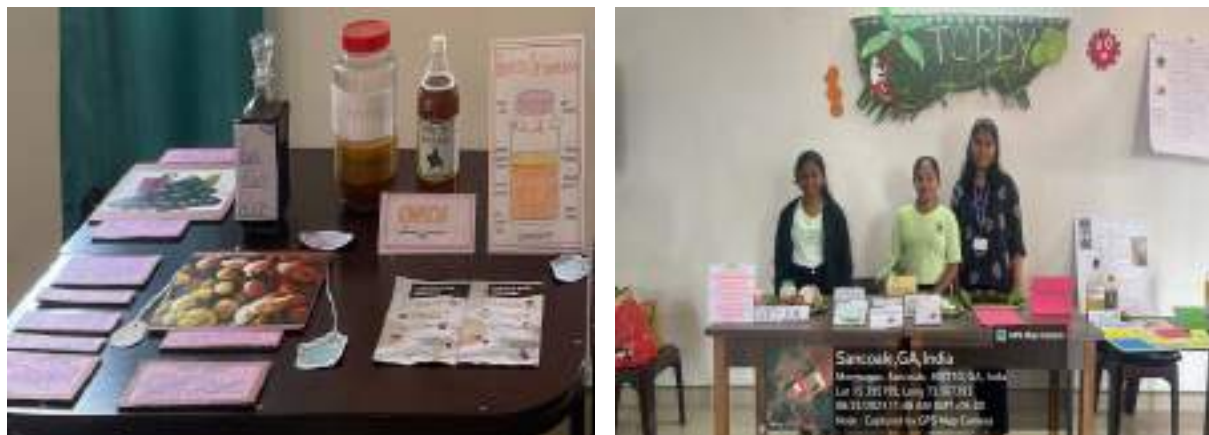
Awareness programme on 'Fermented Foods and their health benefits'