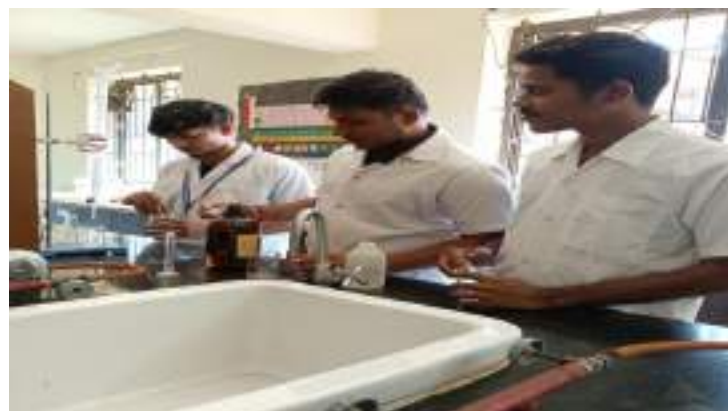
Testing of well water sample