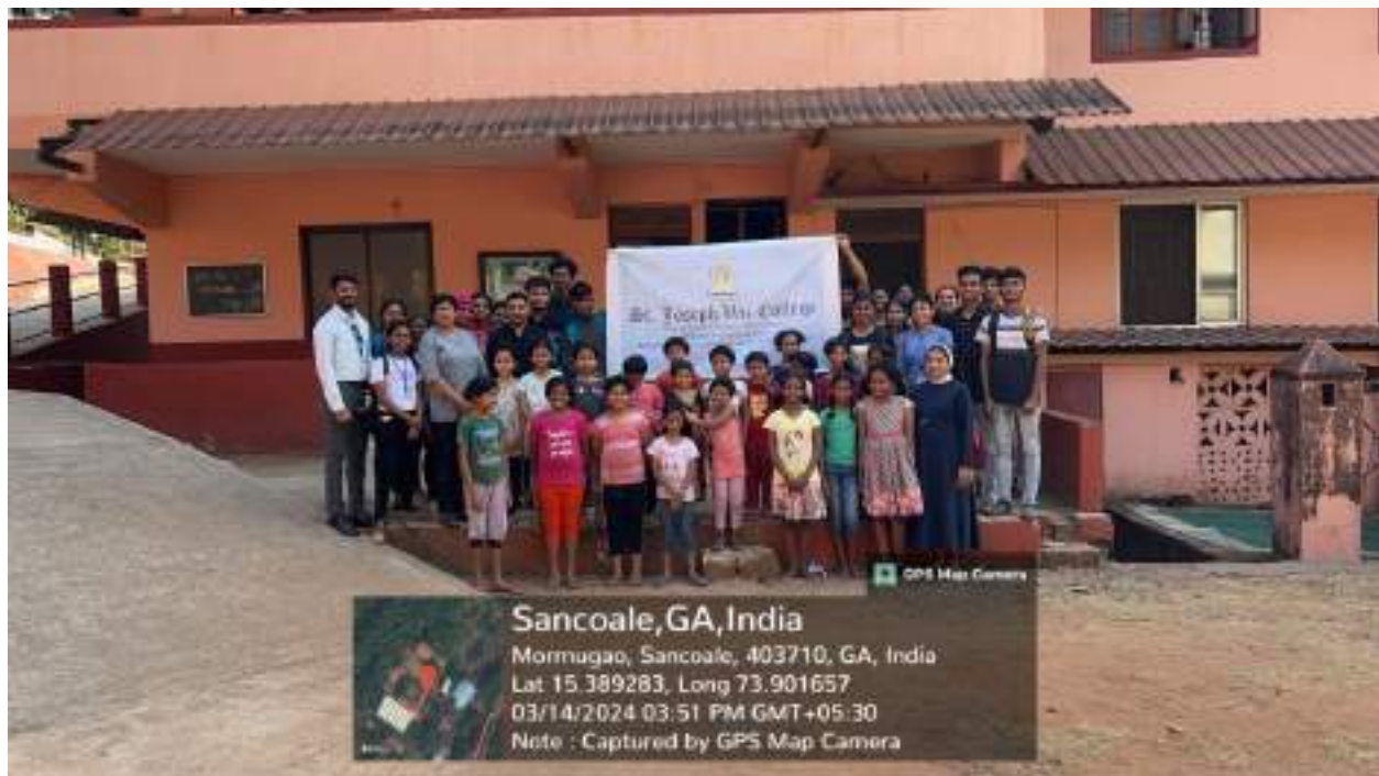
A visit to the Holy Family Convent Boarding, Sancoale