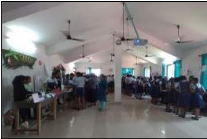
Display of Fermented food by SJVC students