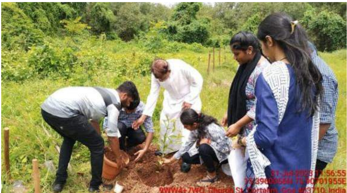
Inaugural Programme of Vrikshmitra