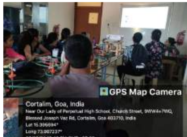
The Journal club with the aim of inculcating the habit of reading and learning about the new techniques in the field of life sciences and to develop interest in the field of research.