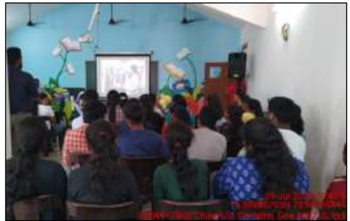
Akhil Bhartiya Shiksha Samagam