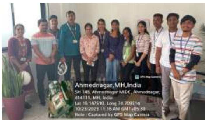
SUN Pharmaceutical, Pune