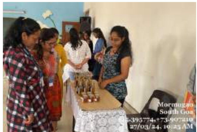
Entrepreneurship cell of the college in collaboration with the Department of Microbiology organized Entrepreneurs sale in the college premises.